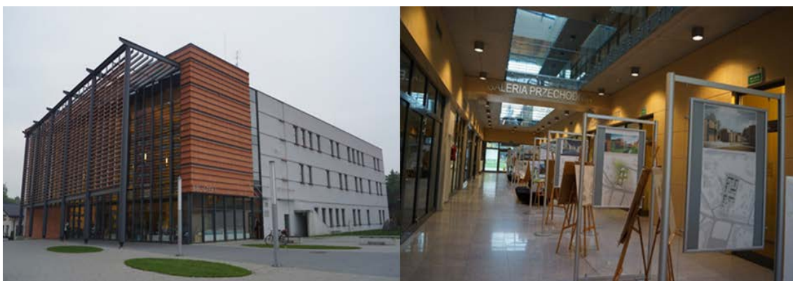
Pictures 17 and 18: Students' works exhibition at Oświęcim on October 2015 in the public library.

The town gave prizes for the works, as chosen by Town Hall representatives, bureaus and scholars (Pictures 17 and 18).