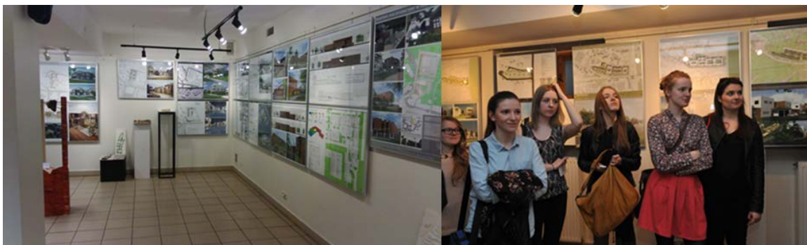
Pictures 13 and 14: An exhibition of university, local government and business was held between 16 and 28 May 2017 at the Galley Gil and the Gallery Kotłownia.

The most interesting studies, urban-architectural creations, also connected with the town of Oświęcim, were presented at the periodic exhibition, University–Local Government–Business at Cracow University of Technology, in the Gallery Gil and the Gallery Kotłownia (Kraków, Warszawska Street 24) (Pictures 13, 14, 15 and 16).