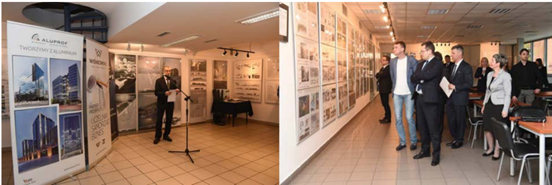
Pictures 15 and 16: An exhibition of university, local government and business was held between 16 and 28 May 2017 at the Galley Gil and the Gallery Kotłownia.

Similar exhibitions were held in twin towns. Oświęcim held an exhibition in the public library in October 2015 with the projects presented on the town Web site. There was also a competition for town residents.