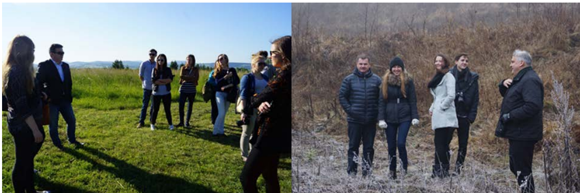
Pictures 11 and 12: Meeting the representatives of local government and business of Nowy Sacz and Krynica.